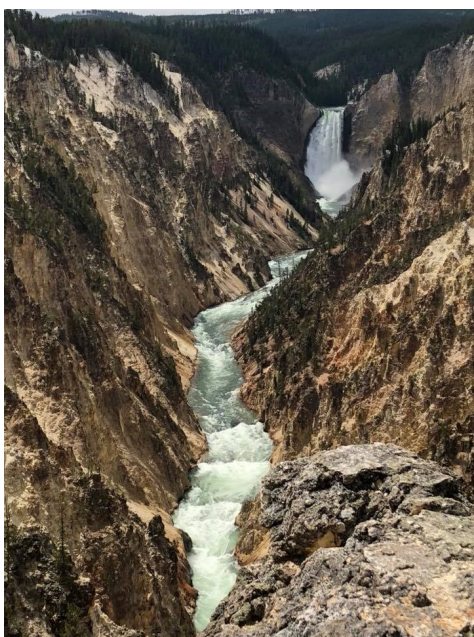
Yellowstone River Lower Falls

I hope each of you are able to take time out to pursue your passions and rejuvenate your souls.